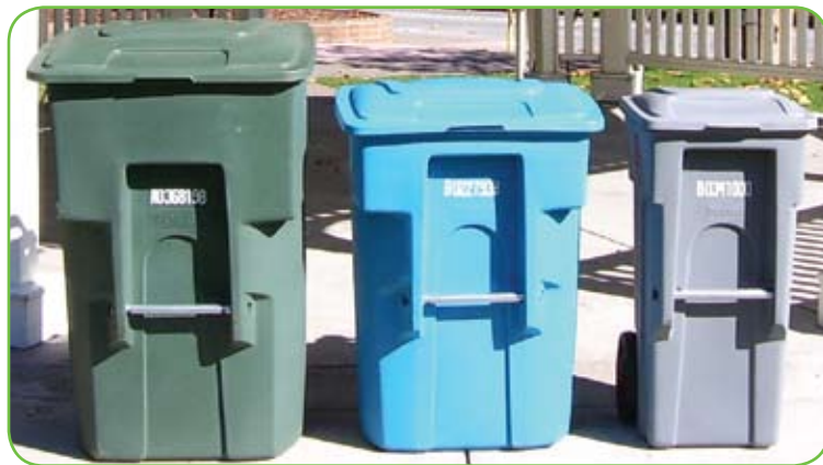
96-gallon yard waste cart

Garbage carts are available in three sizes. Please see cart size examples below: